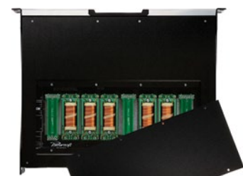
Ottocanali, partially equipped with BatFormers